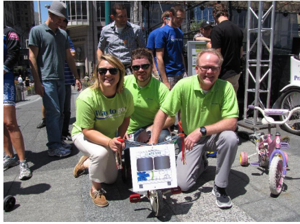
Metro employees participated in the Bike to Work Day tricycle race on Fountain Square

Metro celebrated Bike to Work Day on Fountain Square on May 17, to demonstrate the ease of biking and riding buses.