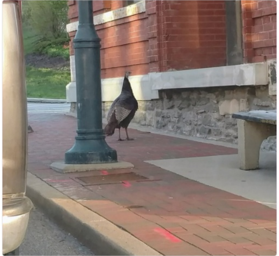
Deirdre and Cecilia Beth

Not a site I've seen before, a turkey vulcher waiting on a bus at Columbia Pkwy and Delta this morning! @Fox19Jessica @cincinnati metro @Enquirer @FOX19Frank @CincyParks