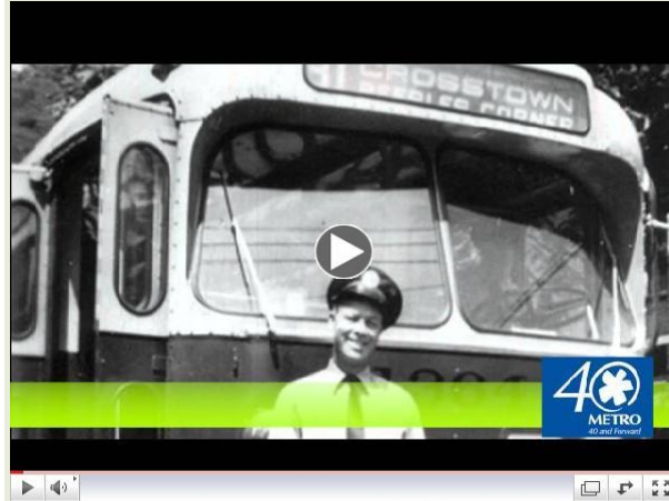
Journey through history with Metro

We invite you to view a slide show displaying a brief history of transportation in the Queen City: